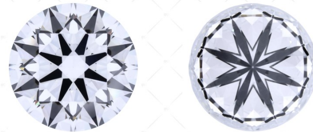
Actual photographs of the crown and pavilion of this lab grown diamond. View hi-resolution photos at GICALUSA.com