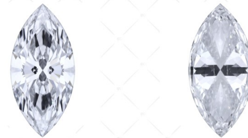
Actual photographs of the crown and pavilion of this lab grown diamond. View hi-resolution photos at GICALUSA.com