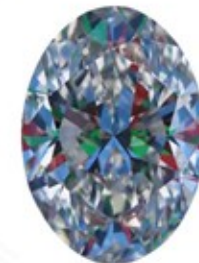
Optical Symmetry Good

The colored areas of the symmetry image are indications of light handling ability, giving a visual representation of proportions and facet alignment.